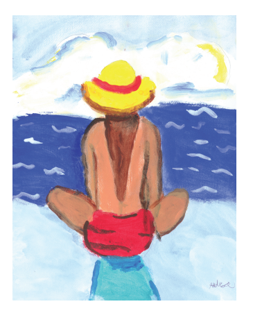
Signed 11x14 Poster $19.95 ($4.95 s/h)