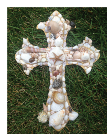
Hand-made Shell Cross by Andrea $25.00 ($4.95 s/h) Each cross varies, depending on shells.